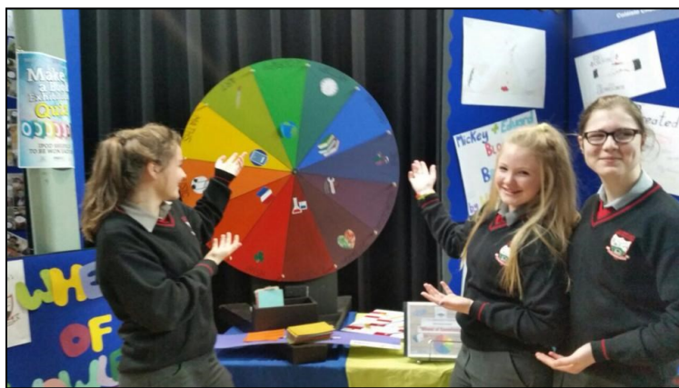
2nd Years & the Make a Book "Wheel of Knowledge"